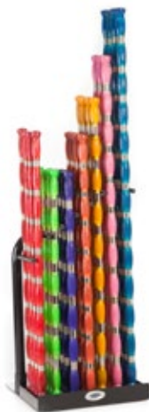
GB-R (W: 21" D: 19" H: 41") Holds Any 28 Aerobic Gel-Bars