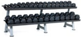
2T-FLT (W: 95" D: 27" H: 32") Holds DBU, PH & HKB