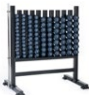
NHR (W: 40" D: 25" H: 42") Holds DBU & NH