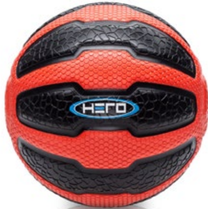
HMB Medicine Ball