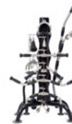
V-MBR (W: 27" D: 17" H: 46") Holds CP-MBU 15 pc. Machine Bar Set (not included)