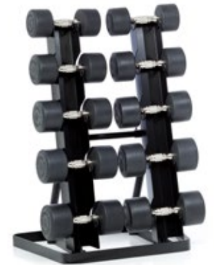
DPU on V-TT-5

Available from 2.5 lbs to 15 lbs in 2.5-pound increments, 15 lbs to 100 lbs in 5-pound increments and 100 lbs to 130 lbs in 10-pound increments.