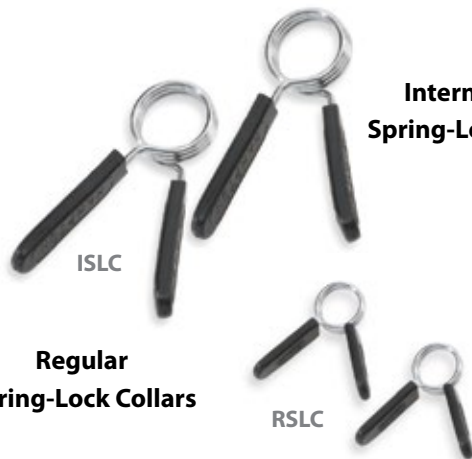
International Spring-Lock Collars