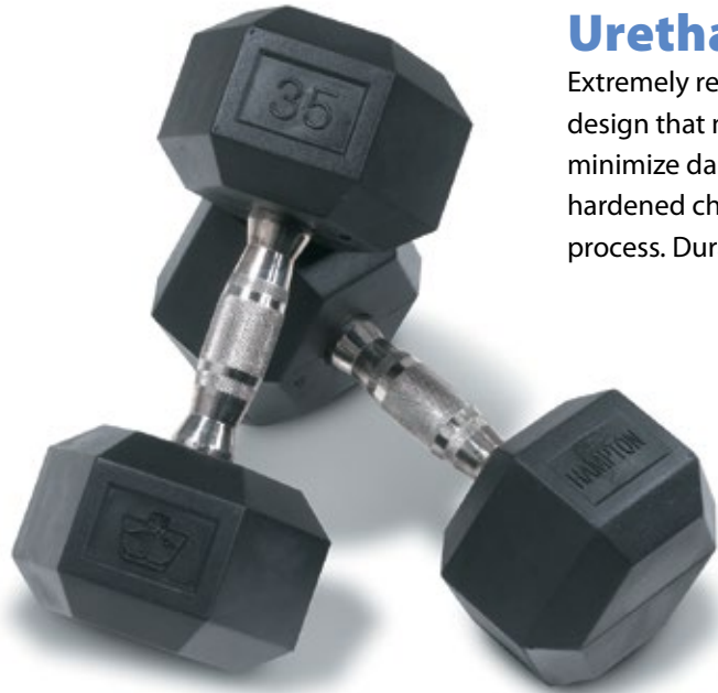
Dura-Bell™ U.S. Patent No. 6,099,443