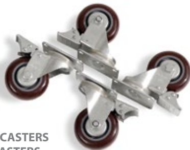
JB-R-CASTERS GP-CASTERS NHR-CASTERS

Hampton Fitness accessories will add style and class to any fitness facility. From our exclusive bar collars to our washable bar pads, we make it easy to accessorize your facility with the durability and aesthetics your customers deserve.