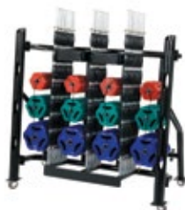
GPS (W: 51" D: 28" H: 56") Holds 40 x 10 lbs, 40 x 5 lbs, 40 x 2.5 lbs plates, 20 gel-grip bars and 20 pairs of collars