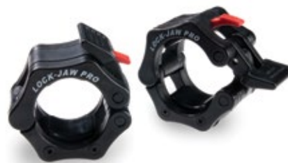
LJC-PRO Lock-Jaw Pro Collars