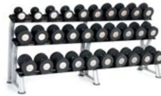
3T-SDL-15 (W: 98" D: 24" H: 42") Holds GGUD, DPU & FDG