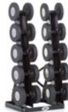
V-TT-5 (W: 26.5" D: 16.5" H: 44") Holds CBGR, DBU, DPU, GGUDB, & PH Holds up to 75 lb pairs