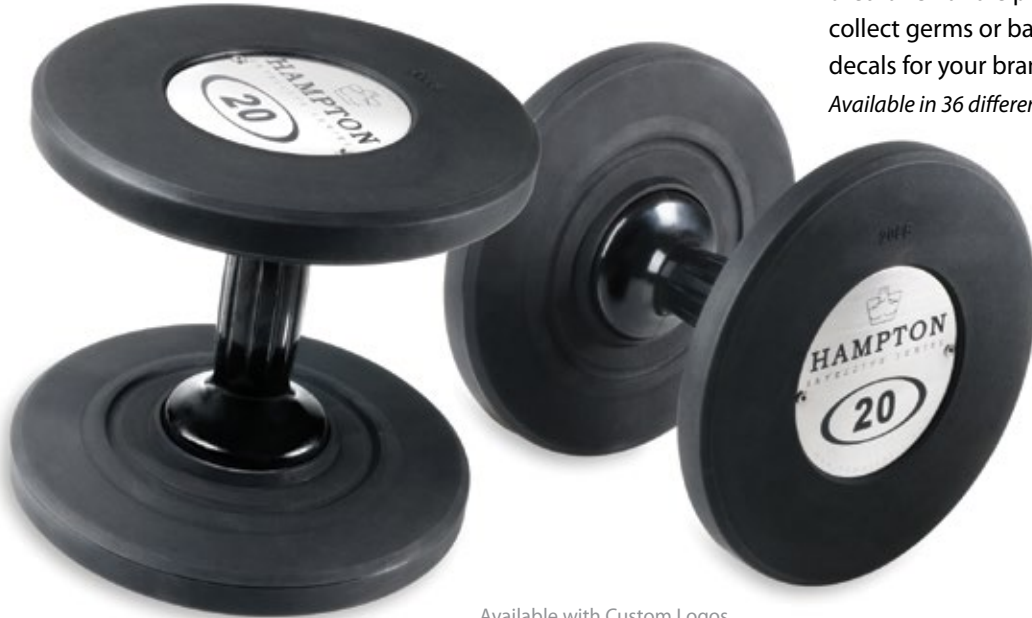
Available with Custom Logos.

Available in 36 different sizes from 5 lbs to 52.5 lbs in 2.5-pound increments and 55 lbs to 130 lbs in 5-pound increments.