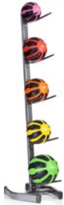
HMBV-5 (W: 18" D: 20" H: 68") Holds HDHMB, HMB, HSB, HWB