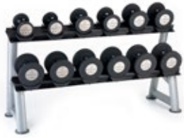
2T-SDL-6 (W: 59" D: 22" H: 32") Holds GGUD, DPU & FDG