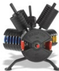
FNR-1 (W: 36" D: 36" H: 40") Holds all Olympic Plates