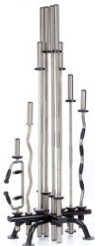
IBR-10 (W: 33" D: 22" H: 10") Holds any 10 Olympic Bars