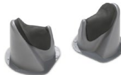
SS-GRAY Shark Push-Up Stands