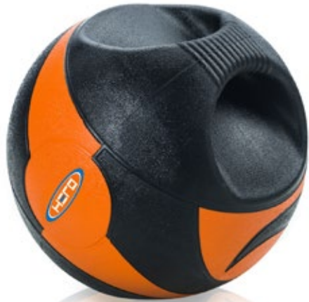
HDHMB Dual Handle Medicine Ball

The origin of the 'medicine ball' dates back 2,000 years to Ancient Greece. Since then, medicine balls have been used in one form or another to build health and strength. Recently, the theory of plyometric weight training has had a resurgence of popularity in the U.S., and whether you're doing lunges, swings or push-ups, Hampton Fitness has the right product for your exercise needs.