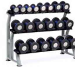
3T-SDL-10 (W: 68" D: 25" H: 44") Holds DPU, FDG & GGUD