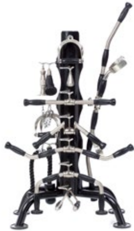
CP-MBU-SET W: 27" D: 17" H: 46"

These cable-machine accessories are all hard chrome-coated with ergonomic urethane grips, and the set includes a vertical racking system to keep them all in order. Unlike their foam counterparts, our urethane grips don't absorb sweat and are much more hygienic and durable.