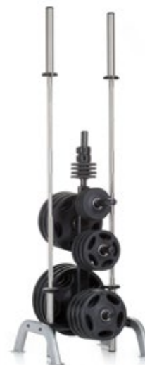
IPT-2B (W: 30" D: 32" H: 55") Holds all Olympic Plates and two Olympic Bars