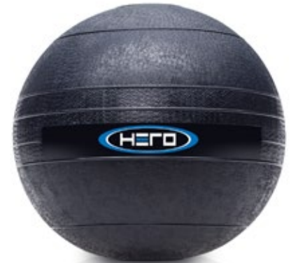
HSB Slam Ball