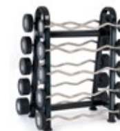
BBR-10 (W: 36" D: 24" H: 53") Holds UB-C/S, FBG-C/S, DB-C/S