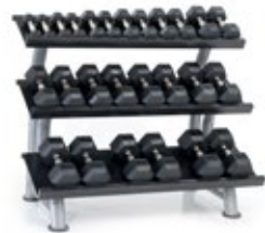
3T-FLT (W: 52" D: 28" H: 42") Holds DBU, PH & HKB