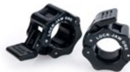
LJC-1 Optional Upgrade