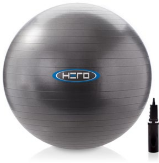
HSB (55cm, 65cm or 75cm)

Stability Balls: Whether you're maintaining your core on a regular basis, or just trying these for the first time, HERO Stability Balls are professionally made to be anti-burst and resilient for any workout. Make the 55cm, 65cm or 75cm balls essential for any workout.