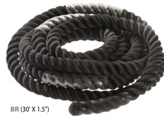
BR (30' X 1.5")

Battle Rope: If you want to get a cardio fix without putting on your running shoes, try getting the perfect HIIT workout using our new Battle Ropes by HERO. These heavy-duty, durable, durable ropes are a MUST HAVE for those looking for a brand new way to get a full body workout. Experience what your body can do. Experience HERO by Hampton Fitness.