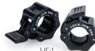
LJC-1 Lock-Jaw 1" Collars