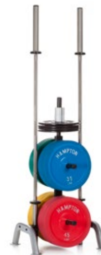
IPT-BP (W: 30" D: 32" H: 55") Holds Bumper Plates and two Olympic Bars