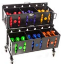
JB-R-2T (W: 46" D: 32" H: 43") Holds JB, DBU & NH