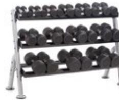
3T-52 (W: 52" D: 20" H: 38") Holds GGUD, DPU, FDG CBGR, DBU & PH