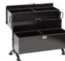
JBR-2T-SOLID (W: 46" D: 32" H: 43") Four compartment utility storage rack.