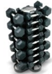
V-4-13 (W: 23" D: 16" H: 42") Holds CBGR, DBU, DPU, & PH 13 pairs up to 50 lbs