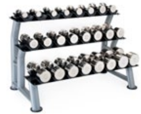
3T-CD-12 (W: 48" D: 26" H: 32") Holds CBGR