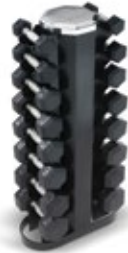
V-2-8 (W: 18" D: 9" H: 42") Holds CBGR, DBU, DPU, & PH 8 pairs up to 25 lbs