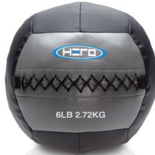
HWB Wall Ball