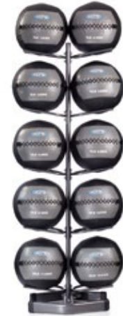
HMBV-10 (W: 18" D: 20" H: 68") Holds HDHMB, HMB, HSB, HWB