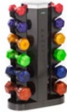
MV-JB-6 (W: 18" D: 9" H: 32") Holds JB-JELLY BELLS 6 pairs up to 15 lbs