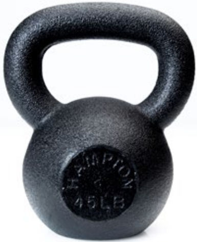
HKBU Urethane Coated

For over 300 years, the Russians have been evolving the Kettlebell to be a brutally effective tool for developing strength, power and mutant work capacity. Kettlebells returned to America in 2001 and their popularity has grown steadily each year. Hampton offers a premium-quality, Russian classic design, urethane-coated Kettlebell ranging from 5 to 100 pounds to match the needs of the rapidly growing army of Kettlebell enthusiasts for home or health club use. Grab the handle of true "old school" training and understand what real functional strength is all about.