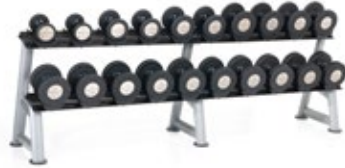
2T-SDL-10 (W: 98" D: 22" H: 32") Holds GGUD, DPU & FDG