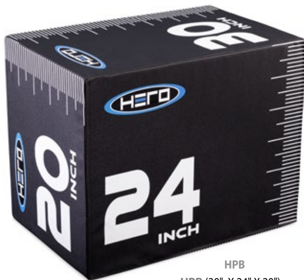
HPB HPB (30" X 24" X 20")

Plyometric Box: Looking to take your workout literally to the next level? These Plyometric Boxes will help increase your stamina through repetition of explosive exercises and height-challenging movements.