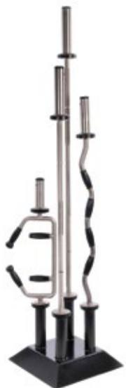
IBR-4 (W: 18" D: 18" H: 13") Holds four Olympic Bars