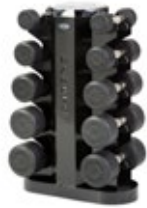
MV-2-5 (W: 18" D: 9" H: 24") Holds CBGR, DBU, DPU, & PH 5 pairs up to 25 lbs