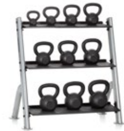
KB-3T (W: 36" D: 18" H: 38") Holds HKB 5-50 lbs