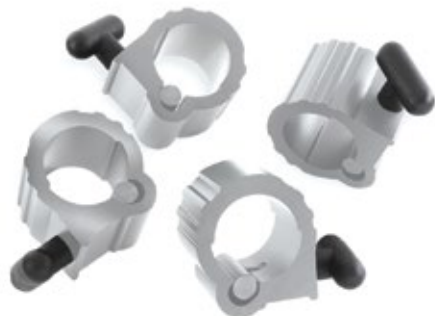
BDC Bulldog Collars