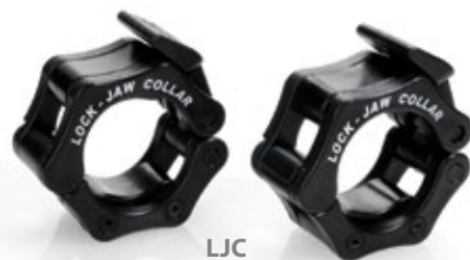
LJC Lock-Jaw Collars