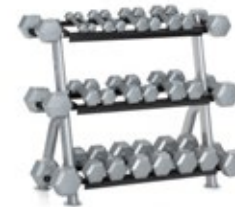
HV-3T (W: 47" D: 20" H: 38") Holds GGUD, DPU, FDG CBGR, DBU & PH