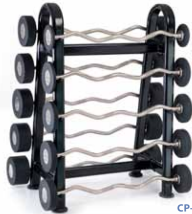
CP-UB-C-20-110 Urethane Coated Curl Barbells (Shown with BBR-10 Rack)