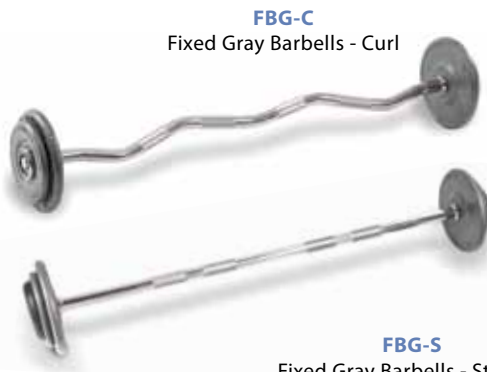
FBG-C Fixed Gray Barbells - Curl